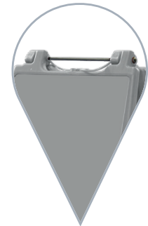
Built-in carry handle