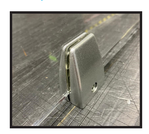
YOUR PACK SHOULD INCLUDE: