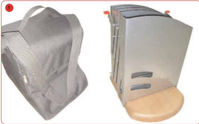
Kit Includes: Aura and carry bag

Important: Ensure fingers are kept clear of folding mechanism when opening and closing the unit