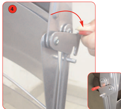
Once unit is fully extended, push the locking arm forwards and secure into place by slotting the hook over the locator pip.