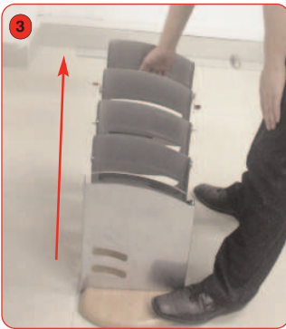
Hold the top pocket, place foot on base and lift unit gently forward and upwards.