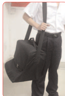
Padded carry bag with shoulder strap and handle for easy transportation