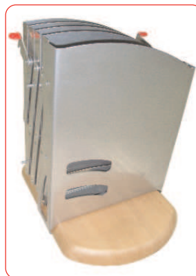
The Aura literature stand folds to a small and handy size for storage